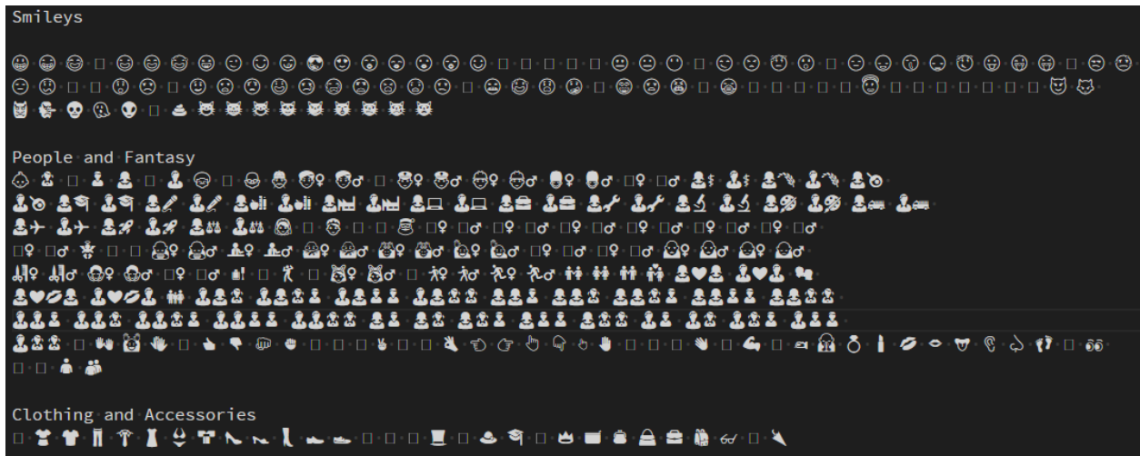
Figure 1: Without the extension